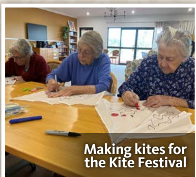
Making kites for the Kite Festival