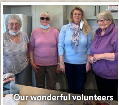
Our wonderful volunteers